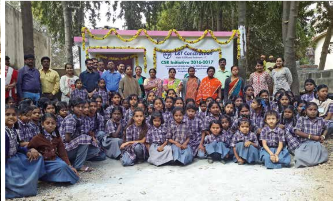
Committed to create better sanitation and social infrastructure

Modern sanitation facilities built: 1 toilet block having adequate sanitation facilities plus two urinals for girls and 1 for boys Total No. of facilities available stands at 5