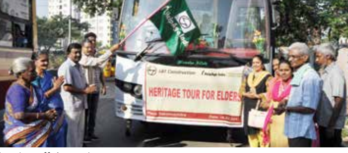
Flagging off the Heritage Tour