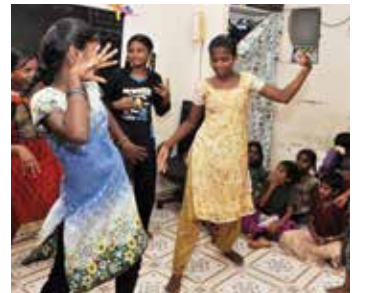
Children break into an impromptu dance