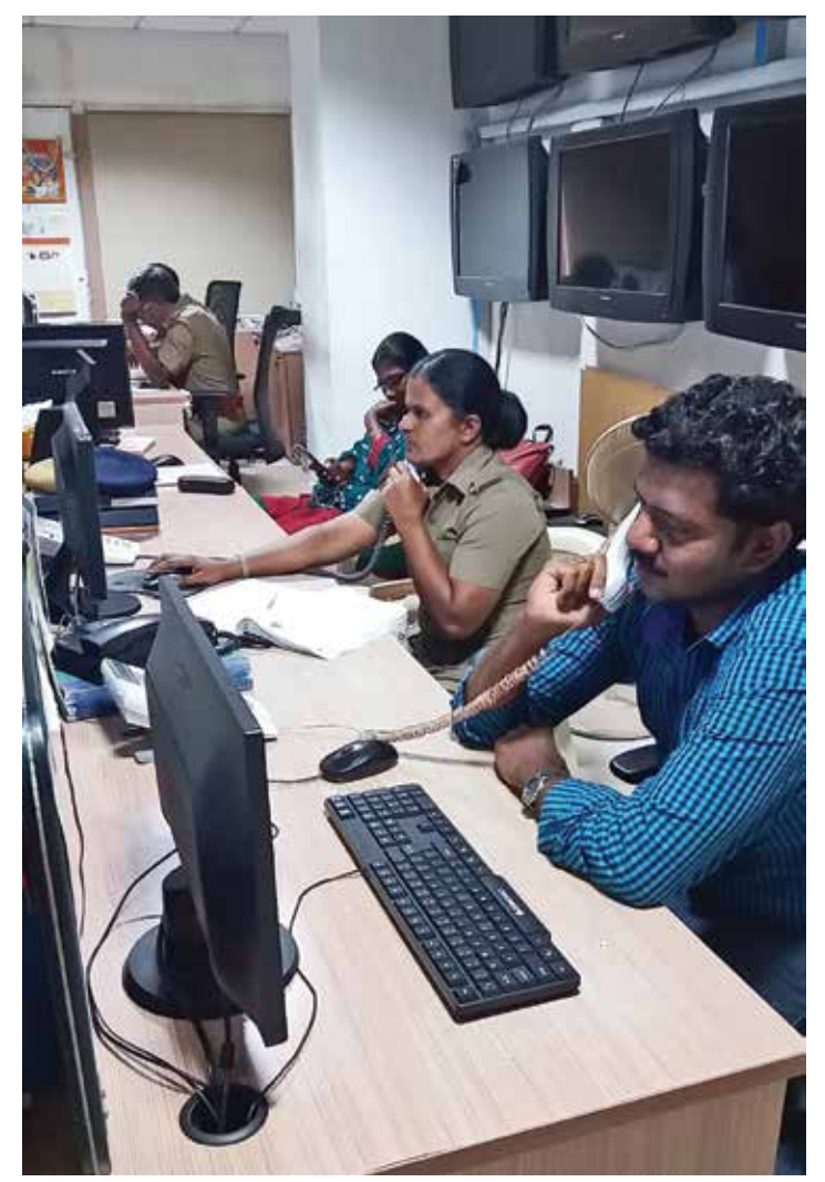
Amidst Action: the Helpline attached to the Police Control Room

The senior citizens are vulnerable as they are gullible due to failing health, loneliness, etc. and easily fall victims to the frauds of charlatans. We have seen many such cases and it is imperative that the senior citizens are sensitised and empowered to seek help. This is an ongoing crusade.