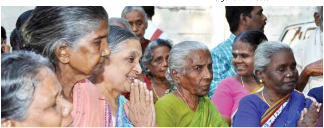
When emotional smiles say it all