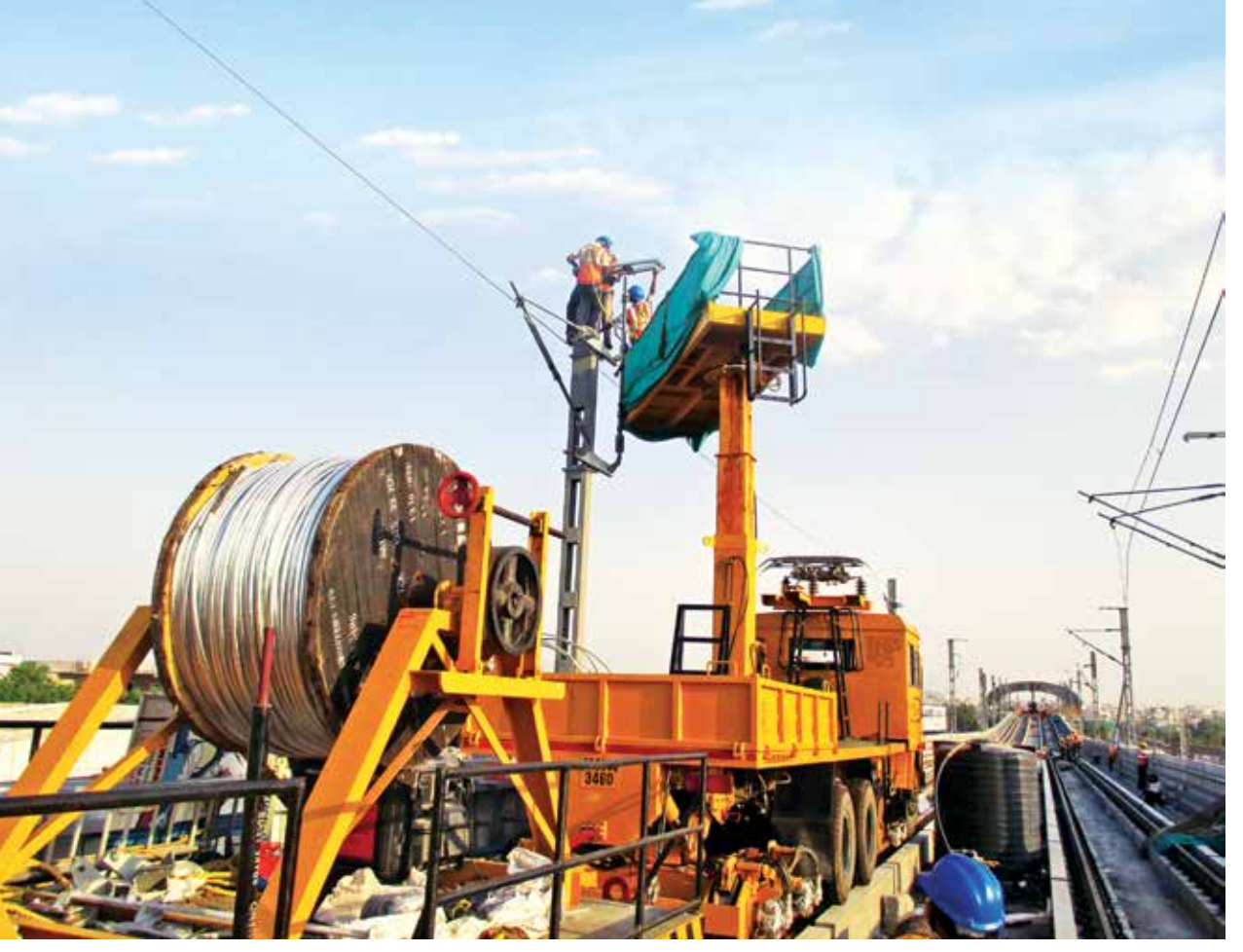
Railway electrification works