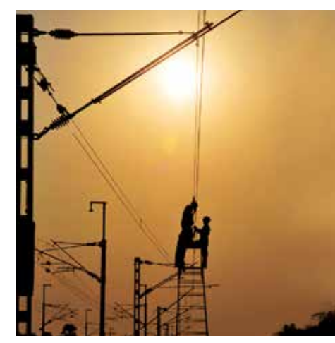
Electrification of the Tiruvallur - Arakonam section

Comprehensive civil and track works: Armed with the expertise to construct rail beds and permanent way works involving embankments, bridges, associated civil works comprising station buildings, passenger amenities and staff quarters, L&T offers total solutions for civil and track works.