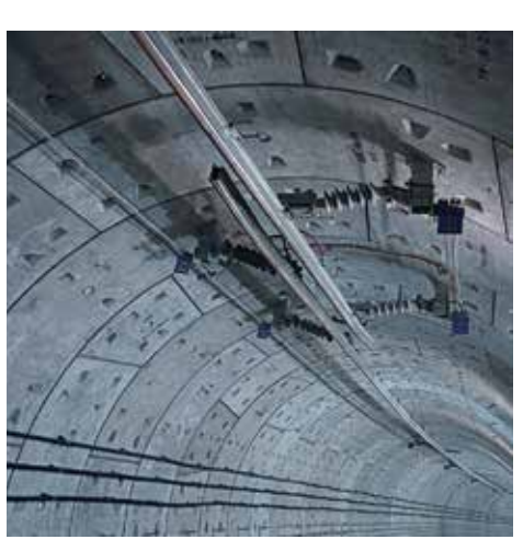
Rigid Overhead Contact System