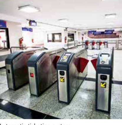
Automatic ticketing system at Mumbai Monorail