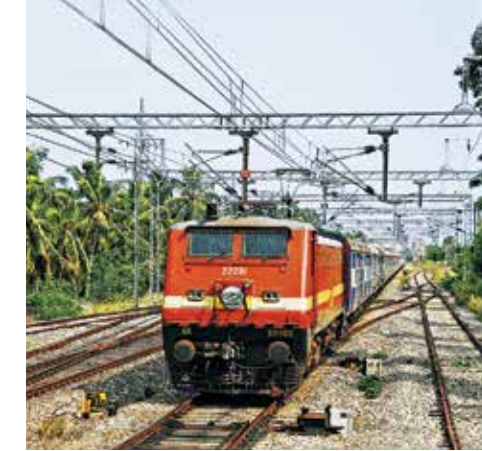
OHE for Kayankulam -Thiruvananthapuram section