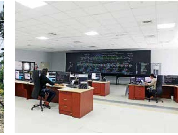
Operations and command centre of Mumbai Monorail