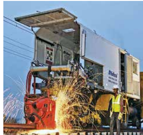
Flash butt welding