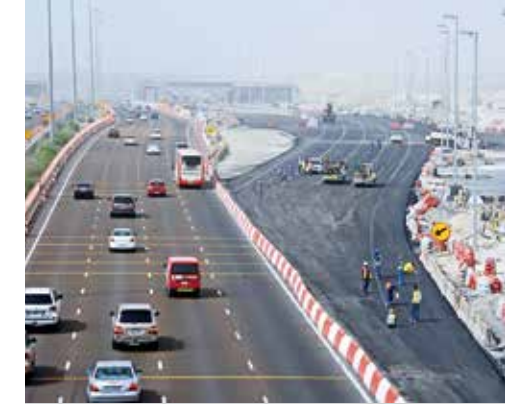
Traffic management at Sheikh Khalifa interchange, Dubai