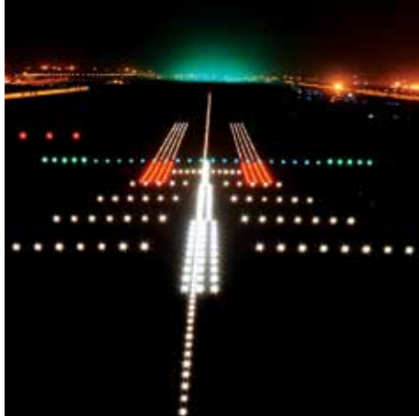
CAT IIIB landing system at Delhi