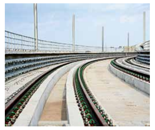
Ballastless track at Chennai Metro