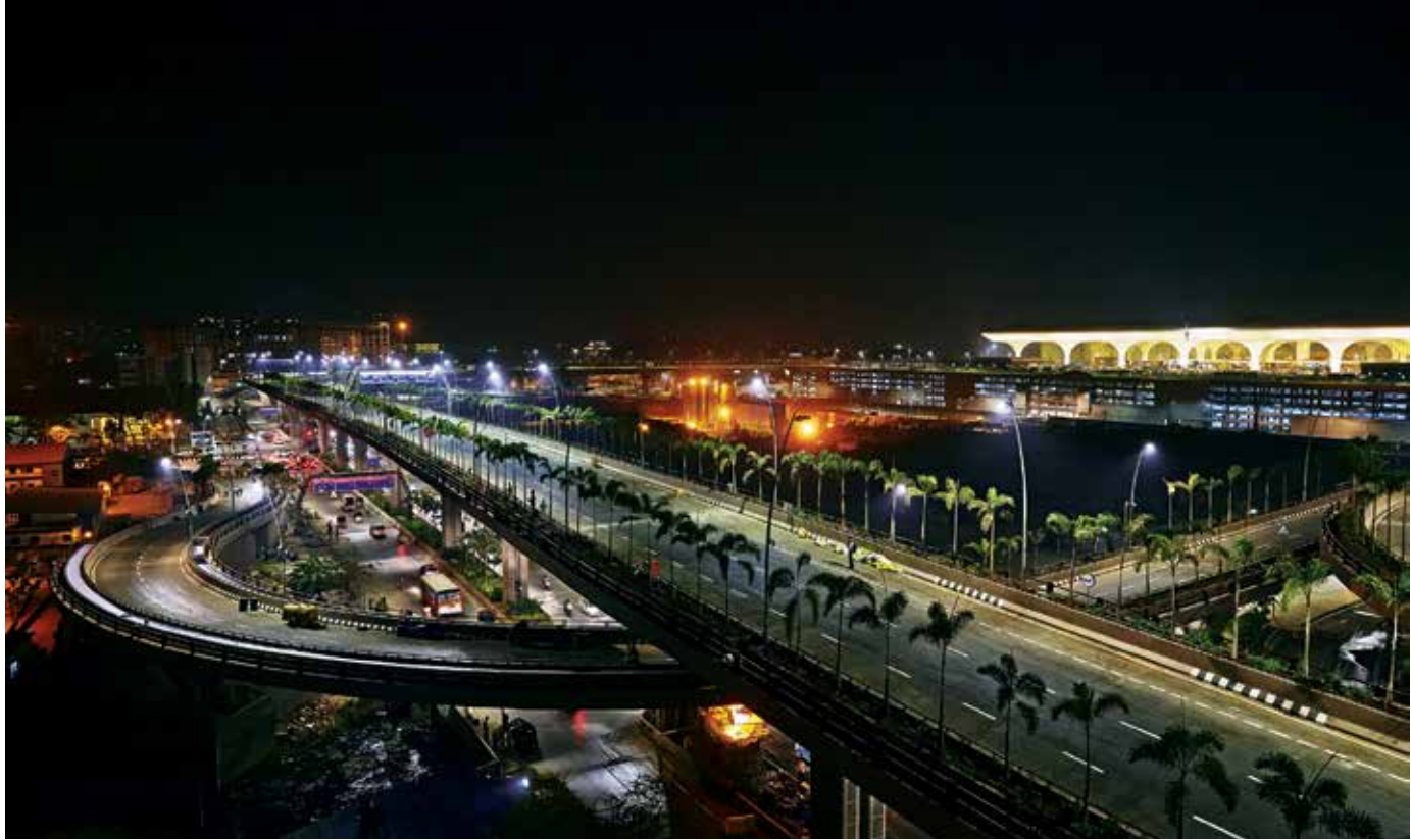
Elevated corridor and forecourt at Mumbai International Airport

Most of the runways built by L&T at international airports like at Delhi, Mumbai, Bengaluru and Hyderabad are compatible with the landing of new generation wide-bodied aircrafts like the Airbus A-380.