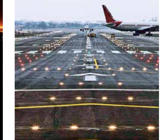
Illuminated view of runway at Mumbai