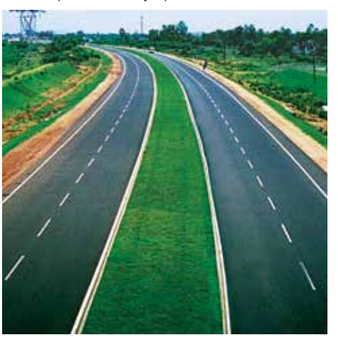
Kancheepuram - Walajahpet road