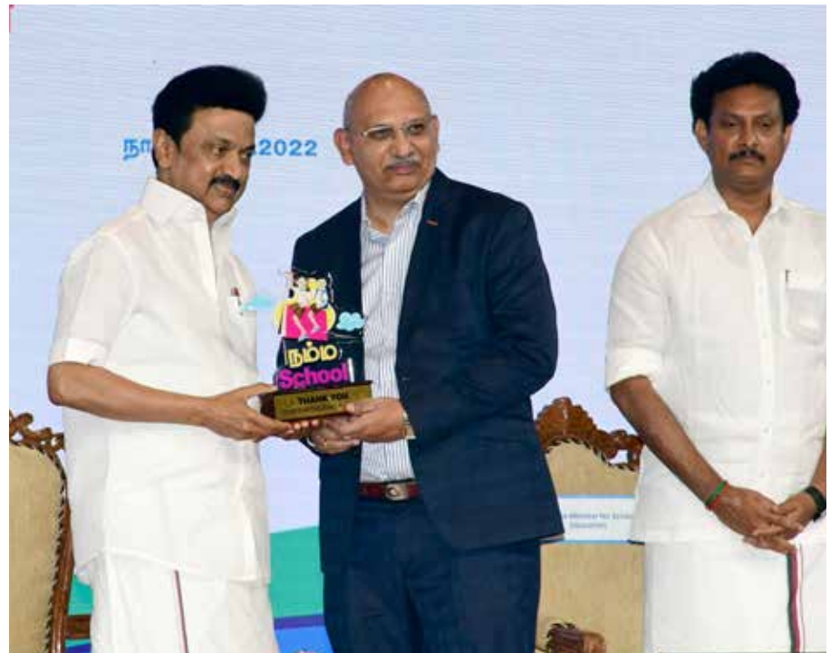
A commitment... and an award

To be utilized in the current financial year, the funds will help develop and build on a range of on-going activities including providing STEM (Science, Technology, Engineering and Mathematics) education through our flagship CSR program titled 'Engineering Futures', nurturing a scientific temper among students through the 'Every Child a Scientist' initiative, establishing smart classrooms, managing community learning centres for less privileged children, constructing new school buildings & renovating old ones, setting up toilet complexes, providing desks and benches, and introducing rainwater harvesting in Government schools. All these initiatives are being steered in partnership with the Department of School Education, Government of Tamil Nadu, and are targeted to be completed by March 31 st , 2023.